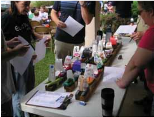
The "Cub Scout Armada"