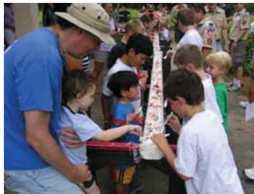
ICE CREAM !!!!!!!