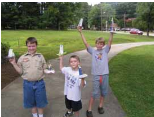
The 3 winners