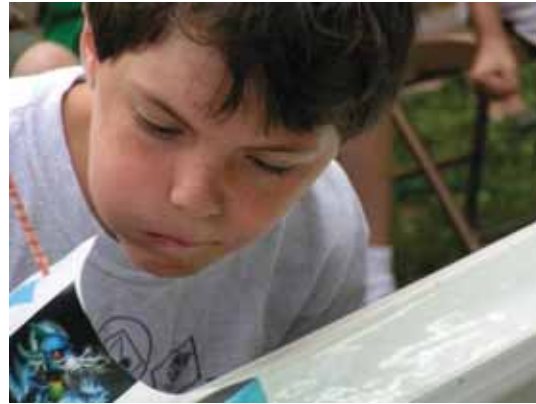
Wind Power moves the boats